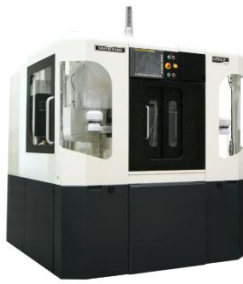
USG-2 (SRS spec.)

CNC Vertical Multi-process Grinding Machine (Large/Middle size)