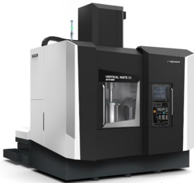
Vertical Mate 85